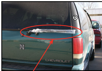
Shown on Vehicle

Great for Protecting Rear Wiper Blades During the Wash Process!