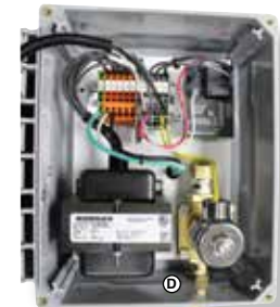
1A046FFA Inside View