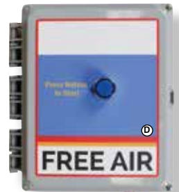
1A046FFA Free Air

All systems are complete with timer, control panel, air solenoids, 50' of air hose, air chuck, start switch with enclosure and stainless hose hanger. Pre-wired panels are ready for installation. Solenoid must be attached to your compressor on site and wired back to the control panel. Pay system includes stainless steel coin meter that can be activated with coins or tokens, (Credit card version also available).