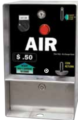
1A046PPA Pay Air