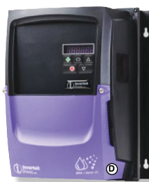
NEMA 4X Enclosure

IP20 (No enclosure) Models are designed for mounting into existing or new electrical control panels. 240 or 460 volt options shown.