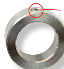
Solid with Set Screw