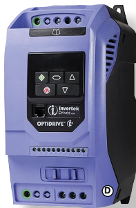
IP20 No Enclosure

Ideal for use with electric motors on pump systems, conveyors, HVAC systems, process controls, elevators, cranes, machine tools ( IP66 and IP55 are standard with coated heatsink that are rated for food grade applications ).