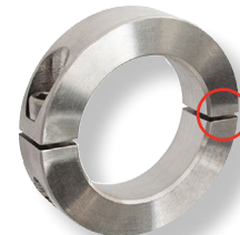
2 Piece 2 Bolts