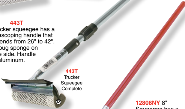
443T Trucker Squeegee Complete

443T Trucker squeegee has a telescoping handle that extends from 26" to 42". 8" bug sponge on one side. Handle is aluminum.