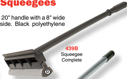
439B Squeegee Complete

443T Trucker squeegee has a telescoping handle that extends from 26" to 42". 8" bug sponge on one side. Handle is aluminum.