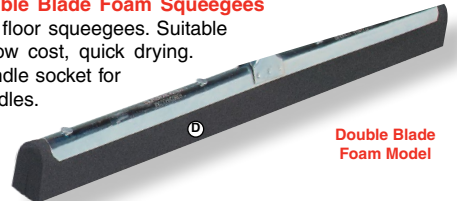
Double Blade Foam Model

MMB18 & 6330 Double Blade Foam Squeegees are soft foam rubber floor squeegees. Suitable for most surfaces. Low cost, quick drying. Adjustable, metal handle socket for tapered 15/16" handles. 18" double sided design.