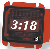
LED7 (Stud Mount)

Keep your customers satisfied with Digital Readout Timers. Red L.E.D display shows continuous countdown of time from start to finish of cycle.