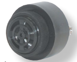
RS1 Horn Included

Dimensions: 3" wide, 1-3/4" high, 3-3/4" deep. Input voltage is 24 volt, AC