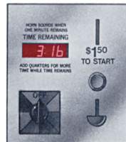
LED3 & LED5 in Coin Meter

LED7 Meter Timer is 3-1/4" H x 3-1/4" W x 2-1/2" D and can be mounted into most existing coin meters. Messages can be in English or Spanish.