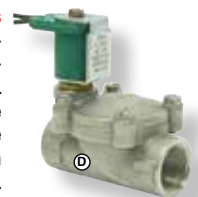
476PS & 478PS

Diaphragm Operated, Stainless Steel Solenoids. Normally-Closed valves feature corrosion-resistant, stainless steel bodies. 24-Volt Models feature spade style coils. 110-Volt models have coils with 12" lead wires. Maximum operating pressure is 150 PSI. Buna diaphragms are standard on 476/478, EPDM on 463/464.