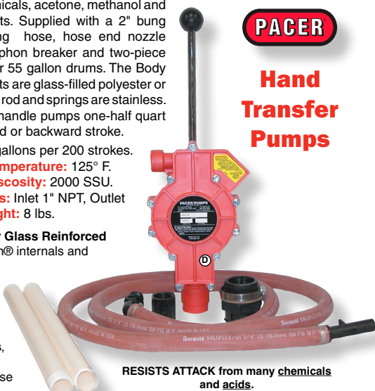
RESISTS ATTACK from many chemicals and acids.

Products that use a petroleum based material such as diesel fuel will require pumps with Viton® internals.