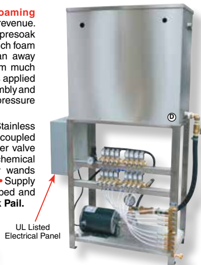
UL Listed Electrical Panel

Standard Features Include: Stainless steel stand and tank • Close-coupled pump/motor unit • Hydrominder valve for automatic mixing • Startup chemical • Coil bay hoses with spray wands • Stainless steel wand holders • Supply tubing and fittings • Pre-plumbed and Pre-wired • Start-UP PreSoak Pail.