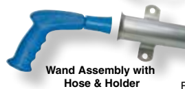
Wand Assembly with Hose & Holder