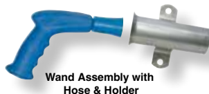
Wand Assembly with Hose & Holder