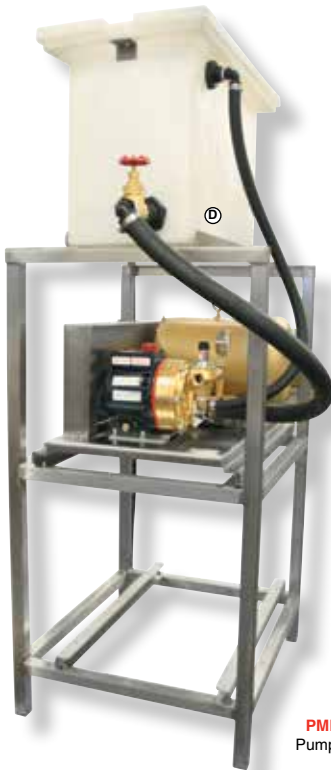
PMD10-TS Pump System

Some Items Built to Order - Call for Availability